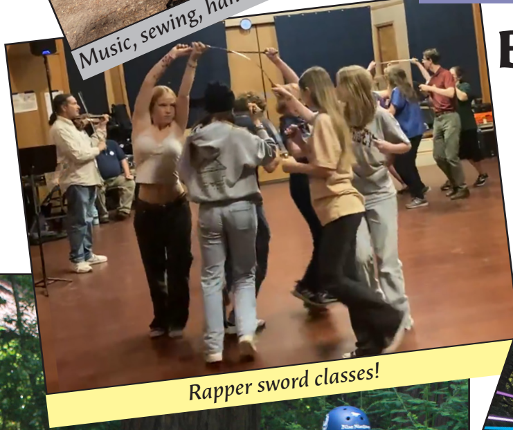
Rapper sword classes!