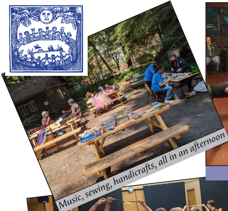
Music, sewing, handicrafts, all in an afternoon