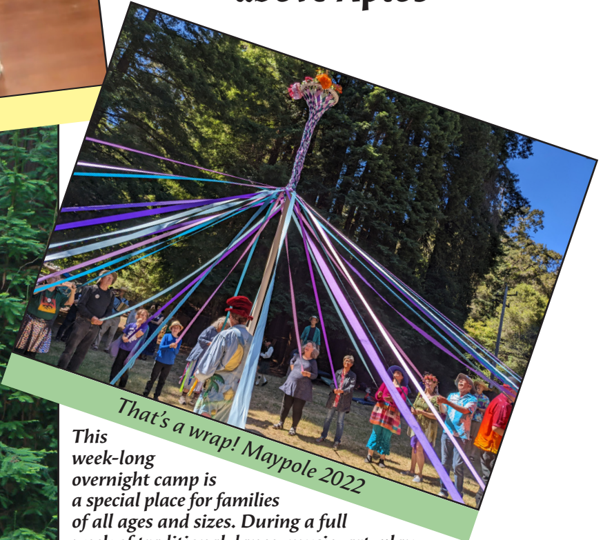
That's a wrap! Maypole 2022

This week-long overnight camp is a special place for families of all ages and sizes. During a full week of traditional dance, music, art, play, meals, & camaraderie, a community grows unlike any other. Come join us!