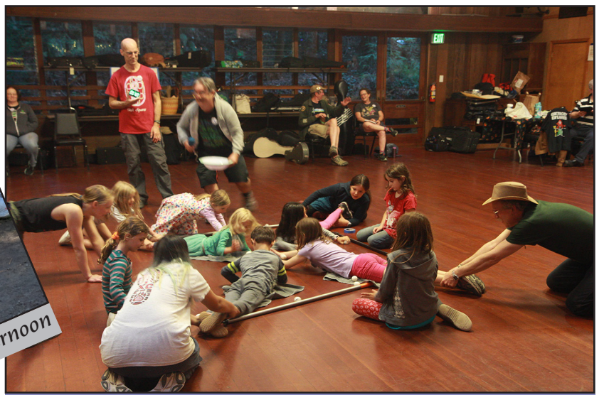
After-dinner game: "Hungry hungry humans"