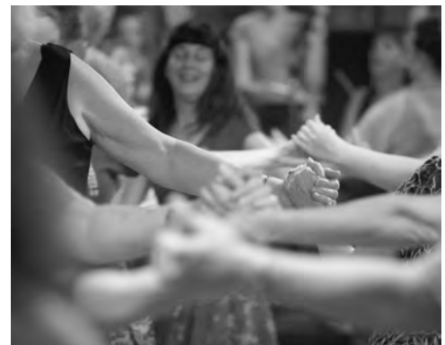
American Dance and Music Week